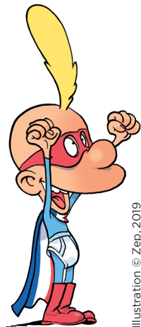
Illustration © Zep, 2019