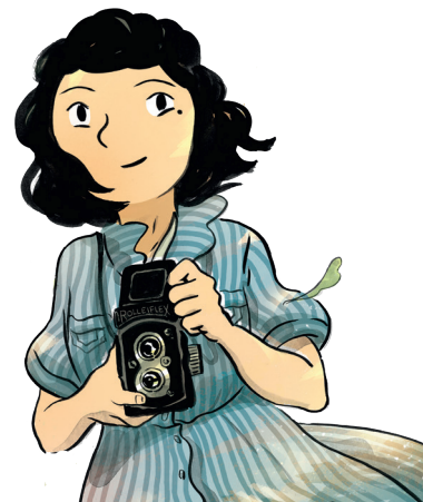
Illustration © Billet/Fauvel, 2019

All titles can be ordered through regular distributors; or contact your sales reps, at the publishers listed, for more information.