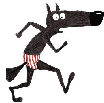
Illustration © Lupano/Itoiz, 2019

This series stars five sisters (and not four as one might think!): The oldest, Charlie, takes care of the others after their parents were killed in an accident, and each volume is narrated by one of the other four. In volume 1, ghostly screams send nine-year-old, free-spirited Enid and her best friend Gulliver off on an adventure.